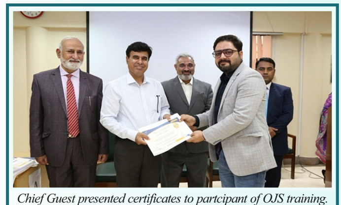
Chief Guest presented certificates to participant of OJS training.