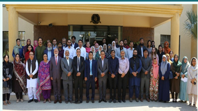
Group photo of the training participants with Project Manager PASTIC at the Latif Ebrahim Jamal National Science Information Center (LEJNSIC), ICCBS, University of Karachi.

The PASTIC National Centre, Islamabad, in association with the PASTIC Sub Centre Karachi, organized a highly beneficial one-day training workshop on "Open Journal Management System (OJS)," on March 7, 2024, at the Latif Ebrahim Jamal National Science Information Center (LEJNSIC), ICCBS, University of Karachi. The workshop aimed to empower the journal publishers' community with modern journal publishing tools and techniques with OJS.