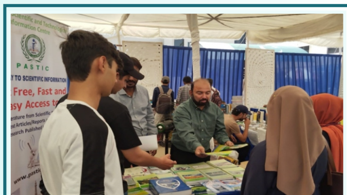
PSCK officials presenting PASTIC services at PASTIC stall.

a. PASTIC Karachi arranged a PASTIC S&T Awareness Services stall during International World Book & Copyright Day celebration at Bahria University Karachi Campus on April 22, 2024. It's noteworthy that over 200 Library professionals, faculty members, researchers and students visited the PASTIC Service Stall.