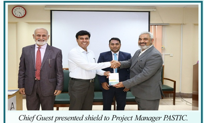
Chief Guest presented shield to Project Manager PASTIC.

The Chief Guest acknowledged the efforts of the organizers and the resource person by presenting them with shields. Additionally, certificates were distributed among participants.