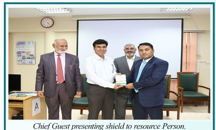
Chief Guest presenting shield to resource Person.