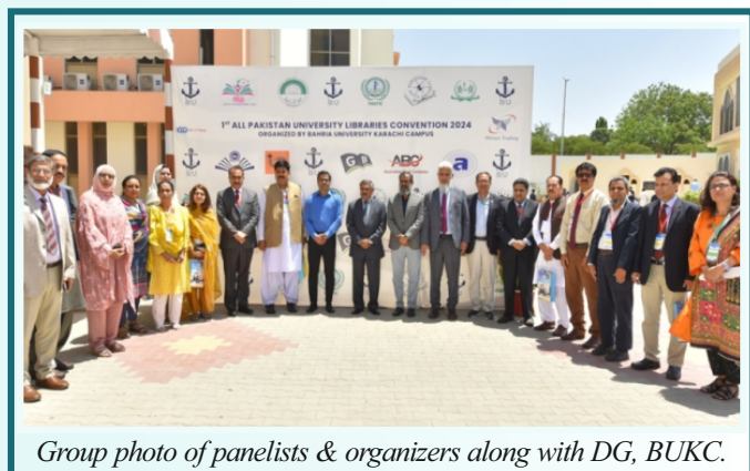
Group photo of panelists & organizers along with DG, BUKC.

The PASTIC Sub Centre Karachi, in collaboration with Bahria University Central Library Karachi Campus and the Pakistan Library Federation Association (PFLA), organized the "First All Pakistan University Libraries Convention" on April 22, 2024, at the Al-Beruni Auditorium, Bahria University Karachi Campus (BUKC). The convention focused on the theme "University Libraries: Highlighting Their Role in Research, Education & Learning."