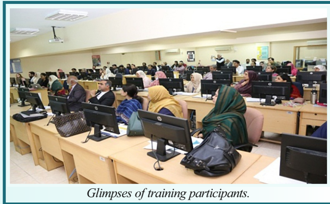
Glimpses of training participants.

session, he actively engaged with participants, addressing their queries and providing insightful solutions. This training equipped participants with valuable knowledge and skills to utilize OJS effectively for publishing needs.