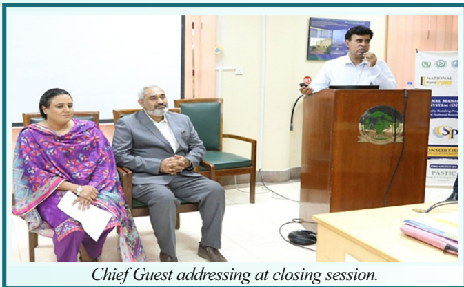
Chief Guest addressing at closing session.